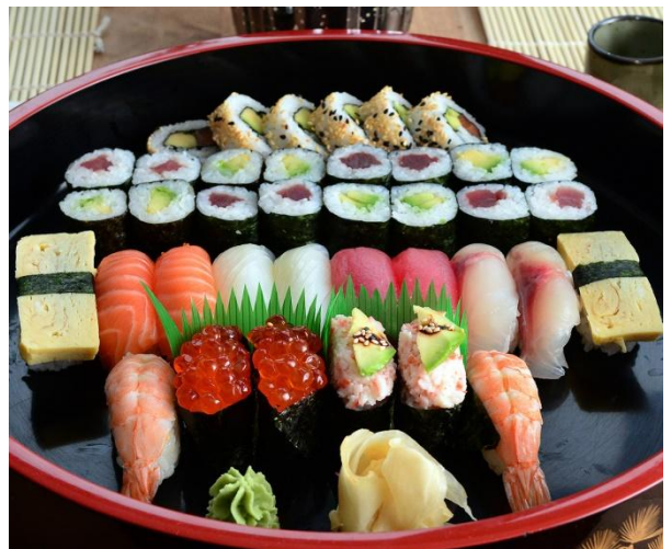
S6. Sushi for 2 1,6 59,90 € 8x Tekka-Maki, 8x Avocado-Maki, 2x Ikura, 2x Sake, 2x Maguro, 2x Ebi, 2x Ika, 2x Tai, 2x Tamago, 2x Kani-Mayo, 6x Sake-Avocado-Roll