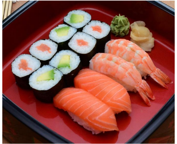
S2. Favorite – Set 14,90 € 4x Sake-Maki, 4x Avocado-Maki, 2x Sake-Nigiri, 2x Ebi-Nigiri