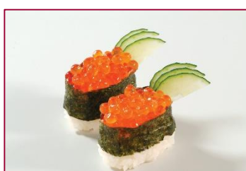
Ikura (Salmon Roe)