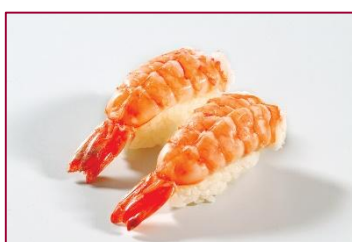
Ebi (King Prawns)