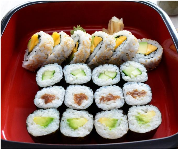
S1. Veggie-Mix 3 12,90 € 4x Avocado-Maki, 4x Kampyo-Maki, 4x Kappa-Maki, 6x Avocado-Mango-Minz-Roll