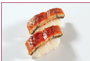
Unagi (grilled Eel)