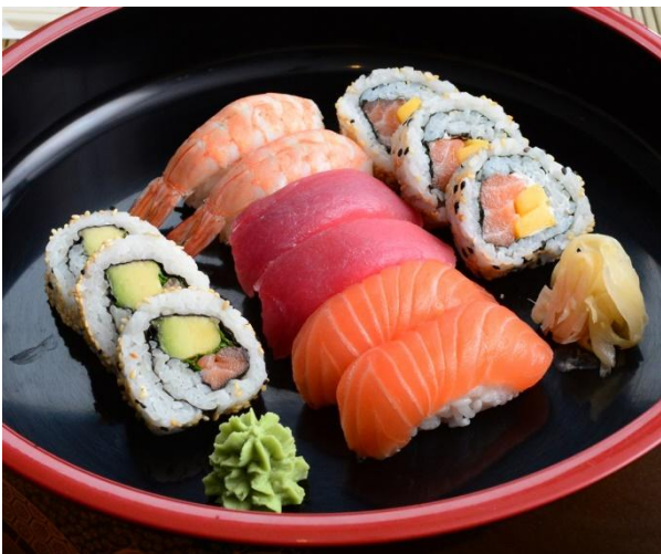
S5. Klassic – Set 21,90 € 2x Ebi, 2x Sake, 2x Maguro, 3x Saigon-Roll, 3x Sake-Avocado-Minz-Roll