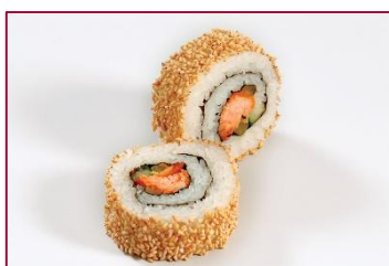
Shio-Sake-Roll (grilled Salmon, Radish, Sesame coated)