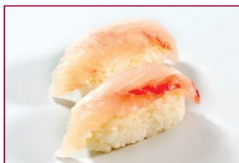
Susuki oder Tai (Sea bass or snapper)