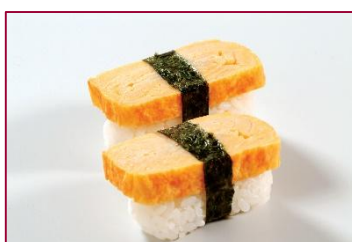
Tamago (Japanese Egg)