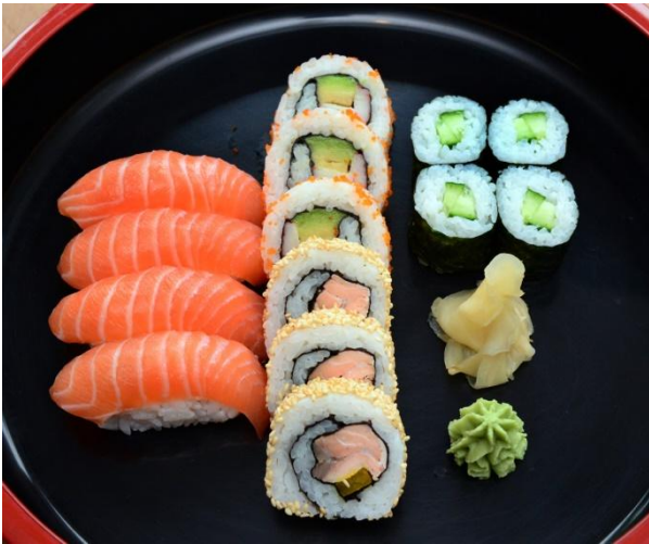
S3. Business - Set 17,90 € 4x Kappa-Maki, 3x California Roll, 3x Shio-Sake-Roll, 4x Sake-Nigiri