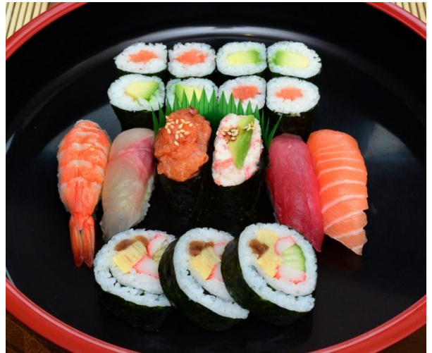
S4. Enjoy - Set 1,6 21,90 € 4x Avocado-Maki, 4x Sake-Maki, Sake, Ebi, Tai, Maguro, Spicy-Sake, Futo-Chu Maki, Kani-Mayo